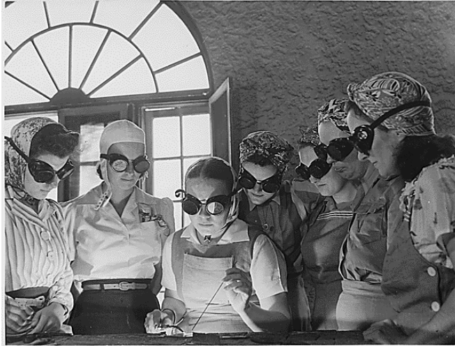
Office of War Information. Secretaries, housewives, waitresses... Daytona, Beach, Florida, 1942