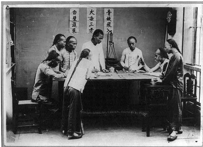
Anonymous. Fantan Pastimes, before 1923

LC-USZ62-80213L:Library of Congress Frank and Frances Carpenter Collection