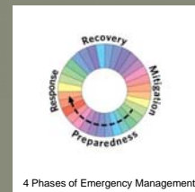
4 Phases of Emergency Management