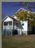
Basement access to alarm panels restricted by porch screening