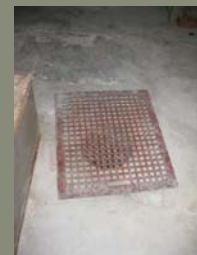
Floor drains need plugs and back-flow valves.