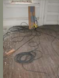
Electrical code violations