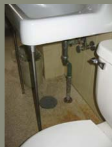
Overflowing dehumidifiers and old plumbing present hazards.