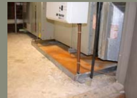
Corrosion is a sign of a deficiency.