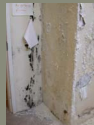
Mold and flaking walls indicate moisture.