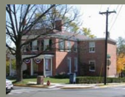
Fire hydrants operable?