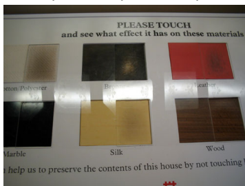
Please Touch display at English Heritage