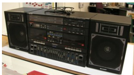
Early 1980s boom box, belonged to Fab Five Freddy, NMAH