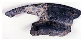
Archaeological pewter plate fragment