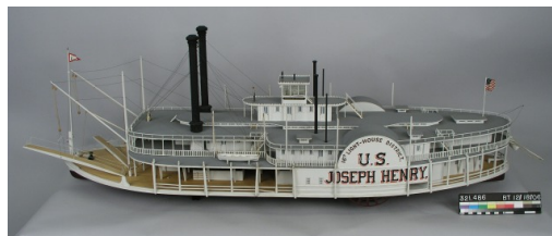
Ship model, NMAH