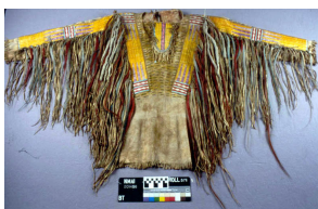
Plains Indian War Shirt, NMAI