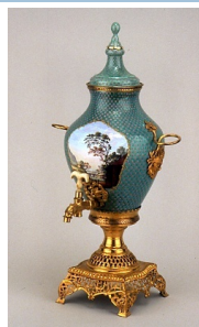
Hot water urn