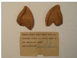
Spock ears from Star Trek II The Wrath of Khan, NMAH