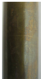
Fingerprints etched in brass