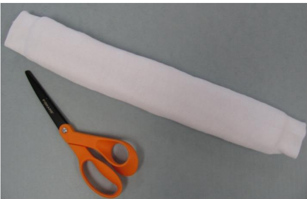
Tuck in the raw edges of the stockinette at each end.

The batting is inserted through the tube and the stockinette is threaded onto the outside of tube. Pinching the batting and stockinette at one end, pull gently a few inches at a time. Always cut the stockinette longer than the final necessary length. Its length shrinks as it expands in width, and you’ll want a little extra on each end.